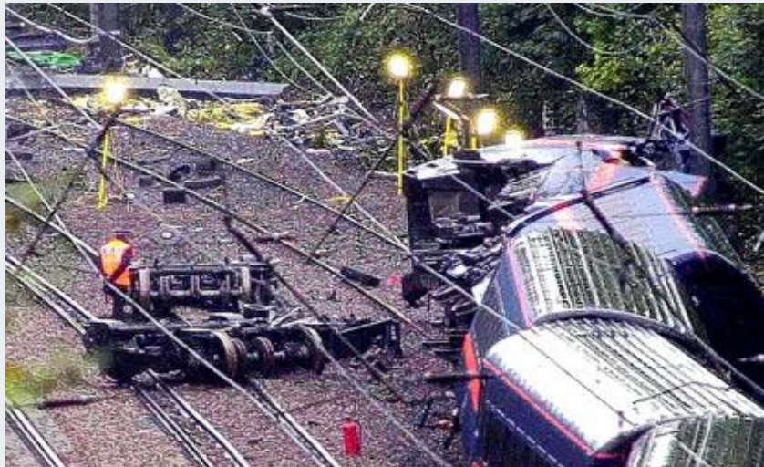
Hatfield Rail crash